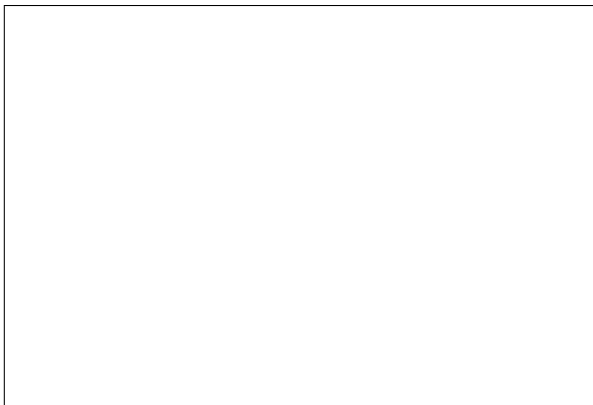
Figure 1. Example of caption. It is set in Roman so that mathematics (always set in Roman: B \sin A = A \sin B ) may be included without an ugly clash.

216 217 218 219 220 221 222 223 224 225 226 227 228 229 230 231 232 233 234 235 236 237 238 239 240 241 242 243 244 245 246 247 248 249 250 251 252 253 254 255 256 257 258 259 260 261 262 263 264 265 266 267 268 269